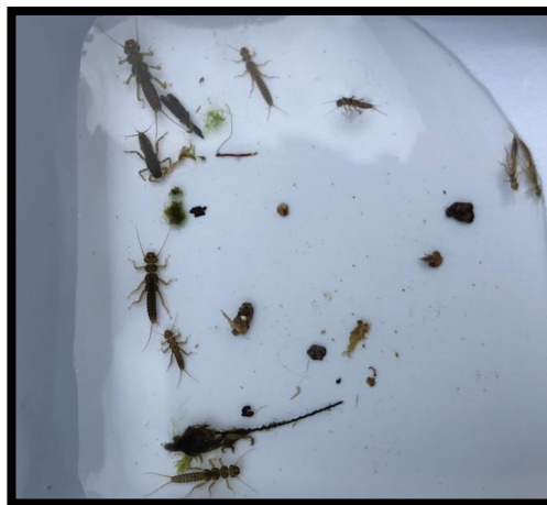
Photo shows kick sample in tray

The South East team are eager to undertake further catchment assessments within the Derreen & Douglas (Kiltegan) AFA, and to work with the local community and state agencies to achieve improvements in water quality.